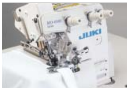
● Blind hemming MO-6905S-0E4-41H/L121 (L121: Blind stitch hemming attachment)

Diversified subclass machines are available. The selection of a machine that best matches the processes in concern are permitted.