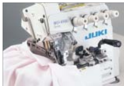
● For gathering MO-6914S-BE6-327/S162 (S162: Swing-type gathering device)