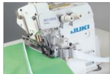
● For rolling-in tape MO-6945S-ED4-360/N077 (N077: Clean finish top and bottom)