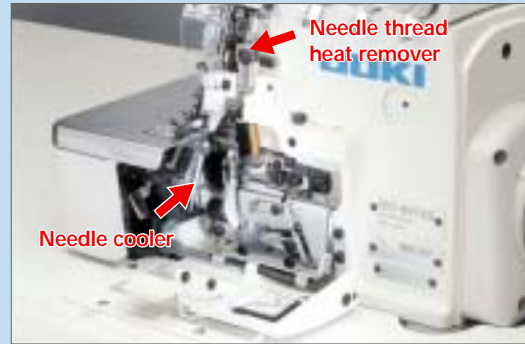
● Runstitching in general fabric MO-6914S-BE6-307