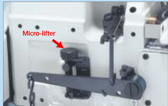
Differential-feed micro-adjustment mechanism