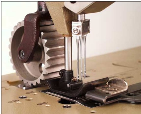
Close-up of the 38200C24 sewing area, showing puller and cloth guides. The 24 gauge needle spacing is equal to 3/8" (9.5mm).